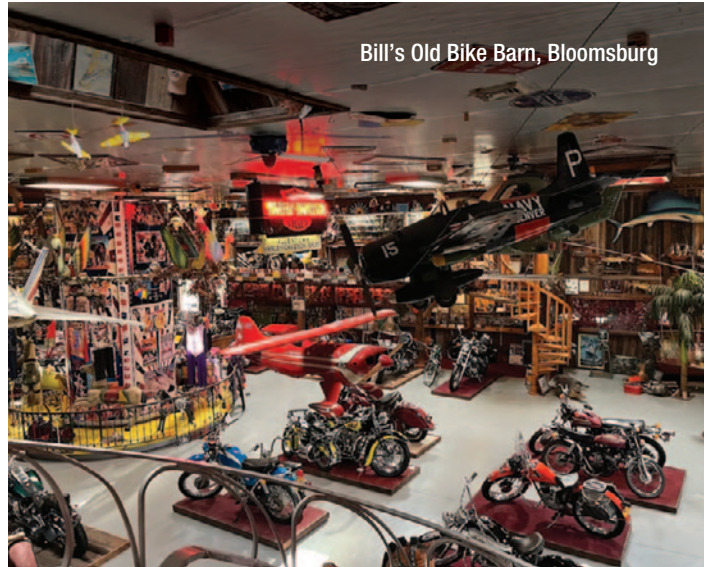
Bill's Old Bike Barn, Bloomsburg